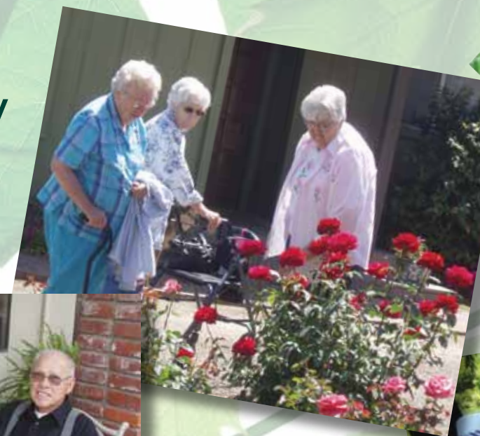
At left: Sierra View roses attract the attention of these gardeners.