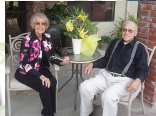
At left: A Sierra View couple enjoys the view from their patio table.