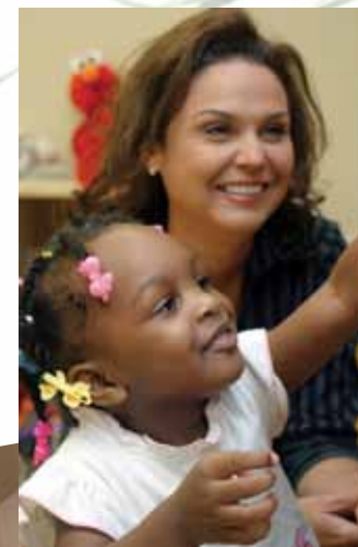
Below: At Prairie View therapy for youth includes group discussion.