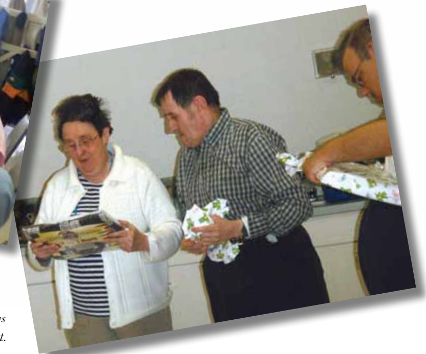
At right: January birthdays are celebrated at Sunny Crest.