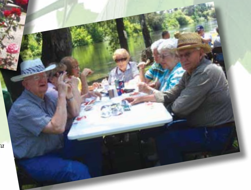
At right: A group from Sierra View visits Kings River.