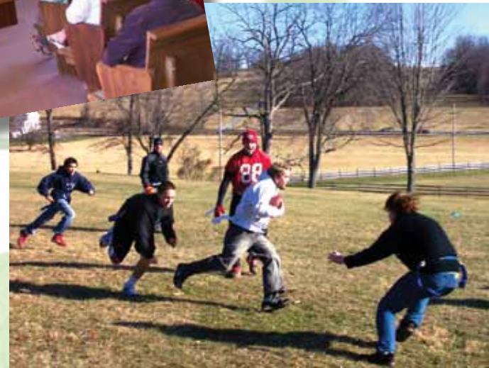
At right: Brook Lane hosts a student-faculty flag football game.