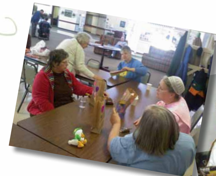
Above: Sunny Crest residents decorated Valentine's day bags.