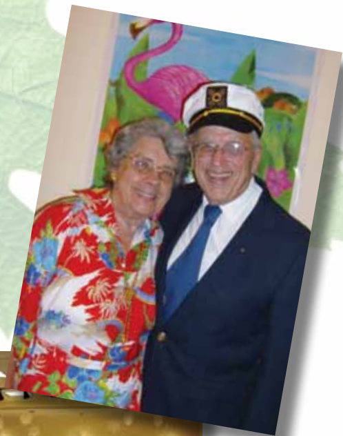
Below: Volleyball is a popular sport at Frederick Mennonite Community.