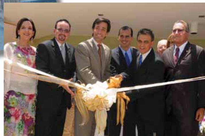
Below: Hospital Menonita inaugurated a mental health hospital, CIMA.